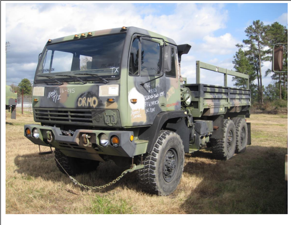
M1083 5 Ton Truck, Cargo 6x6