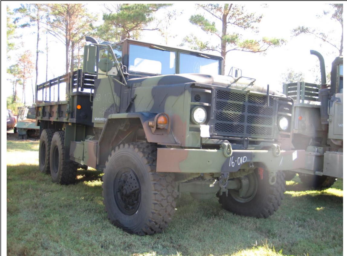
M923A2 5 Ton Truck, Cargo 6x6